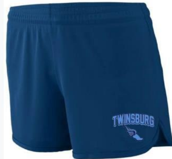
03.) RBC Cross Country 357 Ladies Accelerate Shorts *Required Uniform*