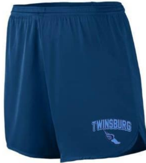
02.) RBC Cross Country 355 Accelerate Shorts *Required Uniform*