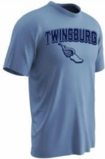
01.) RBC Cross Country BST99 S/S Dri-Fit Vision T-Shirt Jersey *Required Uniform*